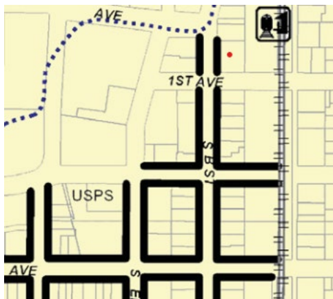
Excerpt from Downtown Area Plan Figure 11

Also, the Property is the only Property with a C1-2/R5 designation that is in the Required Retail Frontage Zone. All other properties within the Required Retail Frontage Zone have a Downtown Retail Core designation and are zoned CBD: