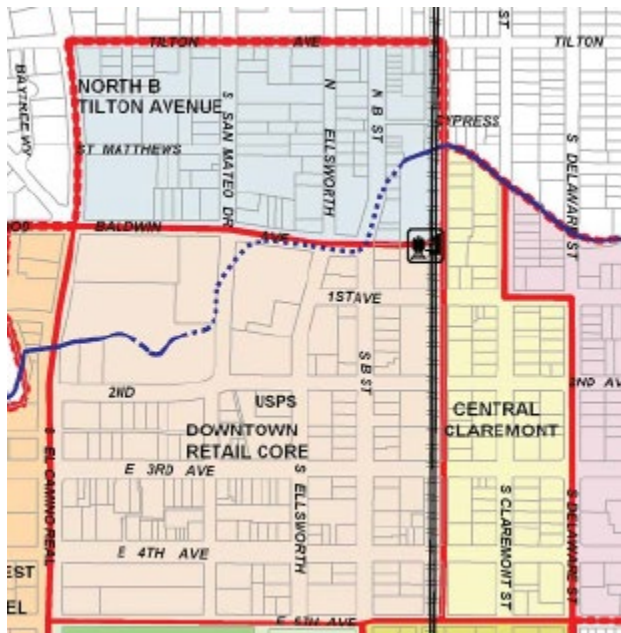
Excerpt from Downtown Area Plan Figure 2