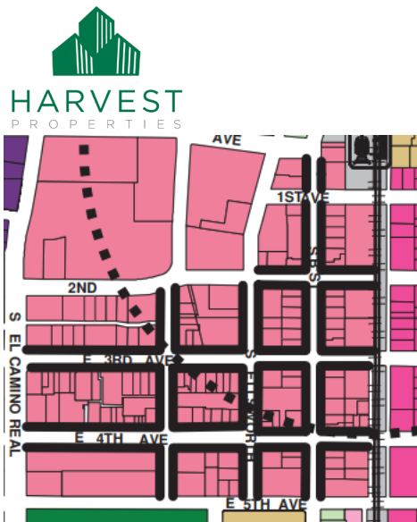
Excerpt from Downtown Area Plan Figure 10

The Downtown Area Plan explains that this zone is intended to “maintain downtown’s commercial vitality and continuity within the retail core .” As further evidence that it appears the Property’s current zoning was an oversight, the implementing ordinance for the Required Retail Frontage Zone is found in the CBD District regulations and no other zoning district. (See Mun. Code §§ 27.38.010(c); 27.38.110.) This is strong evidence that all properties within the Required Retail Frontage Zone were intended to be zoned CBD. It is unclear how the City would apply the detailed Required Retail Frontage standards in Section 27.38.110, such as the uses considered consistent with the zone and minimum dimensions, if the Property is not rezoned CBD.